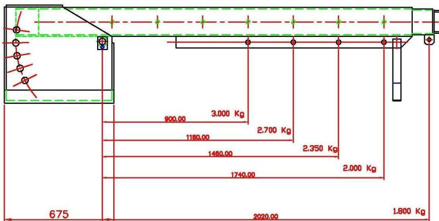
Croquis entrada uñas